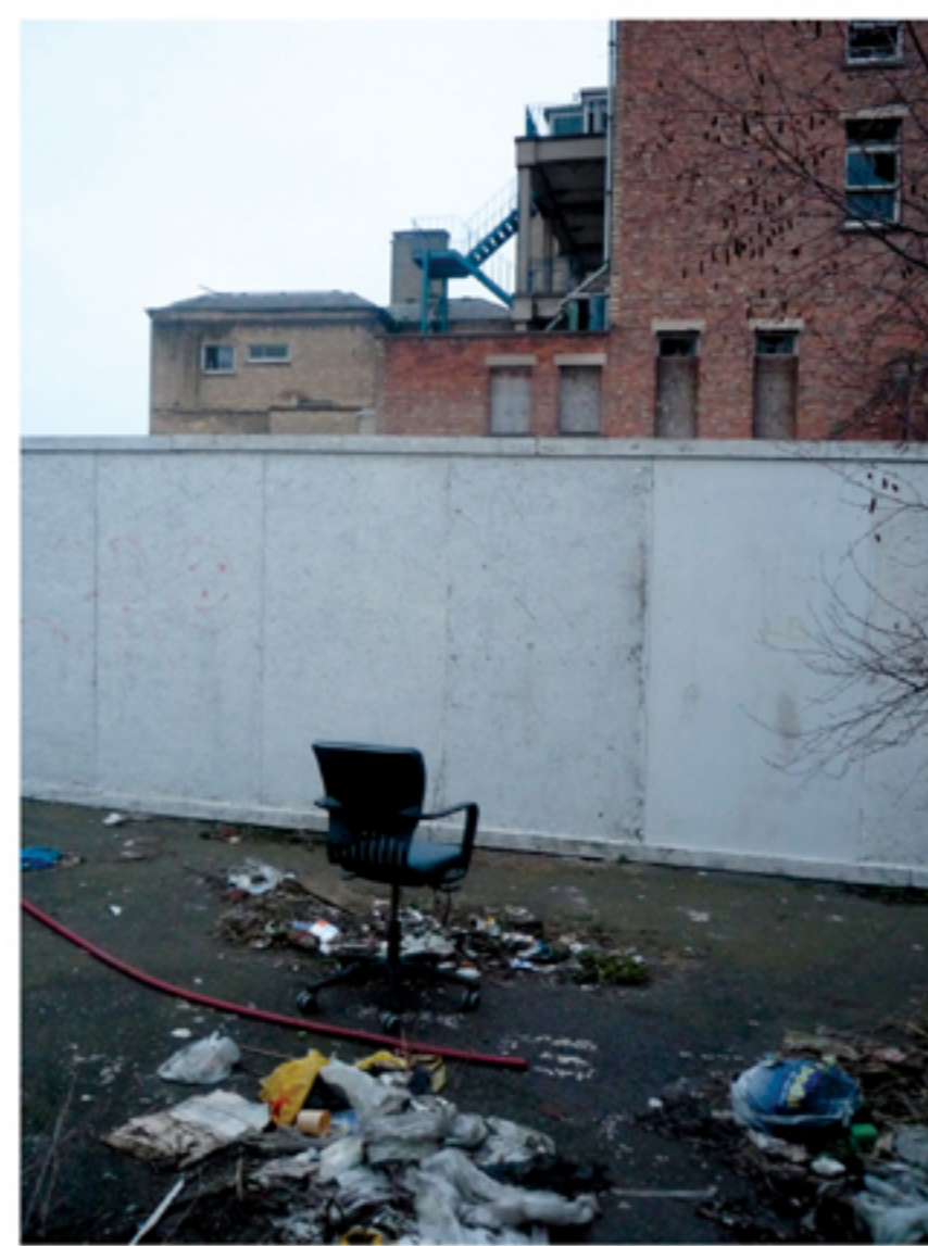
A. N. Uganda: College Lecturer United Kingdom: Local Council Worker